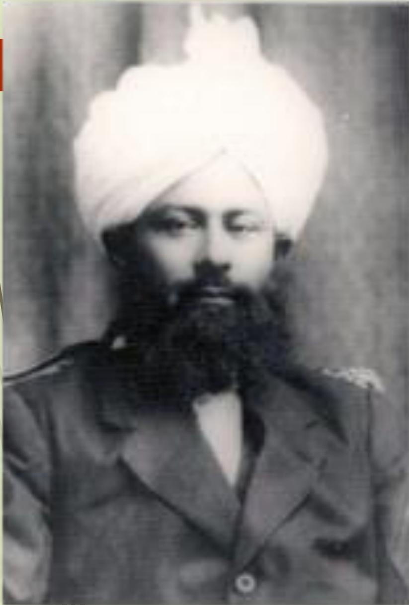
Hadhrat Musleh Maud (ra)